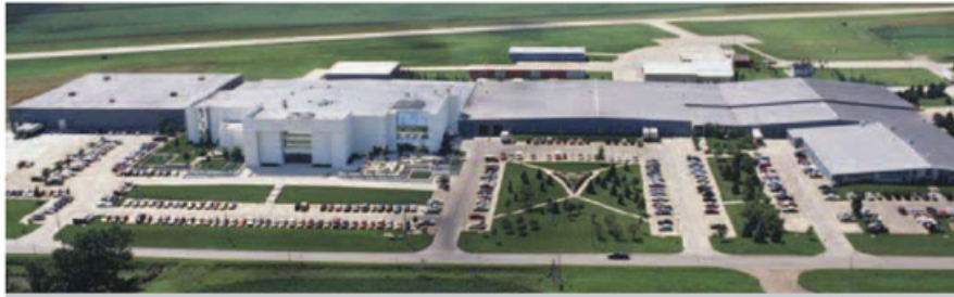
Above: Our property in Orange City, Iowa